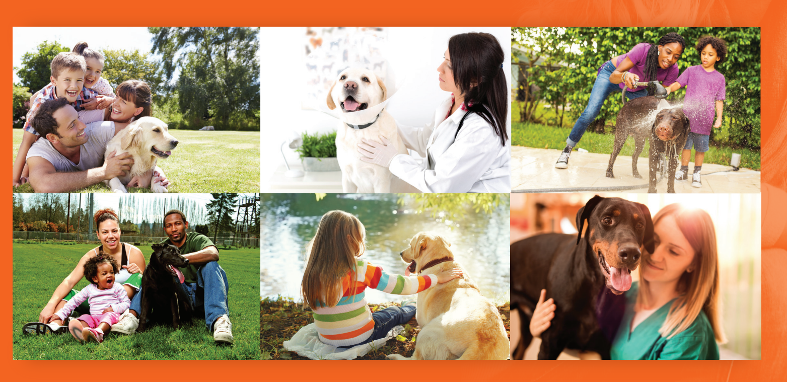
We believe in doing the right things with our partners, 99 within our company and with every pet and pet parent.

MAKING PET LIVES BETTER BY EDUCATING PET PARENTS ON THE IMPORTANCE OF REGULAR VETERINARY CARE AND VETERINARY-RECOMMENDED PET PRODUCTS.